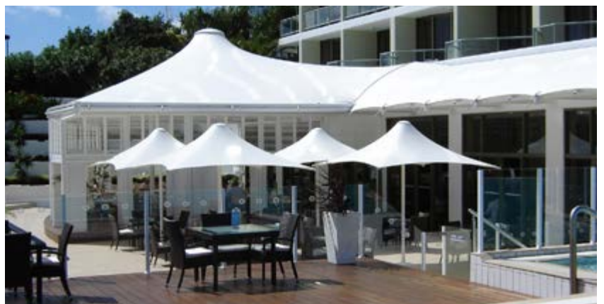
HORIZON 3M SQUARE UMBRELLAS