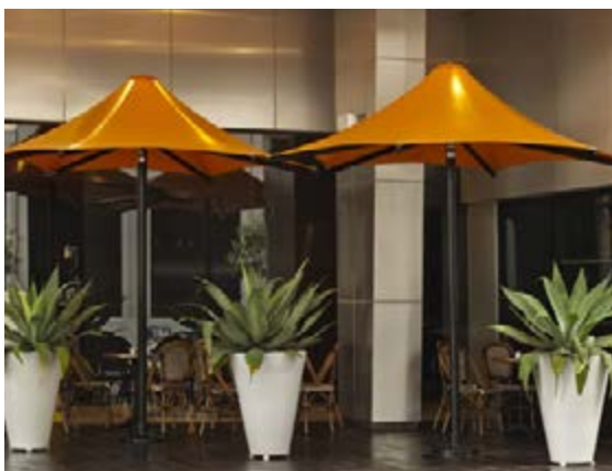
HORIZON 2.4M HEXAGONAL UMBRELLAS