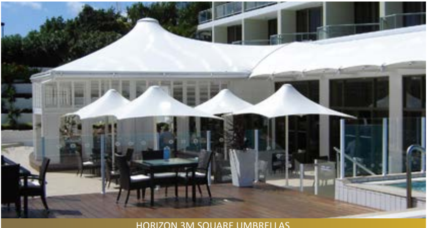
HORIZON 3M SQUARE UMBRELLAS