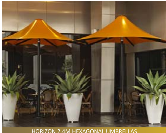
HORIZON 2.4M HEXAGONAL UMBRELLAS