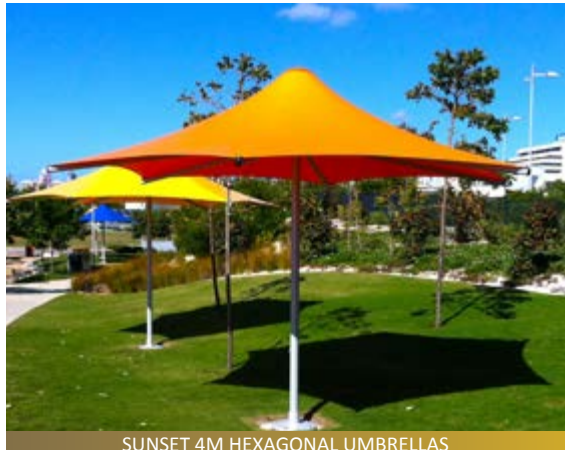
SUNSET 4M HEXAGONAL UMBRELLAS