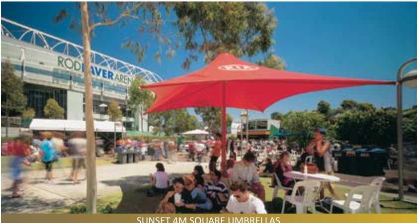
SUNSET 4M SQUARE UMBRELLAS