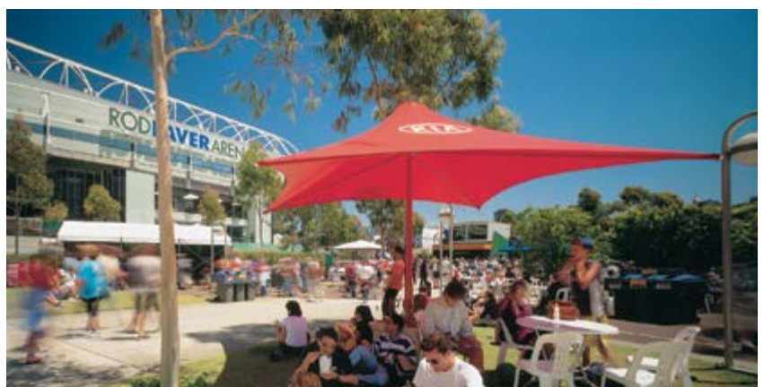
SUNSET 4M SQUARE UMBRELLAS