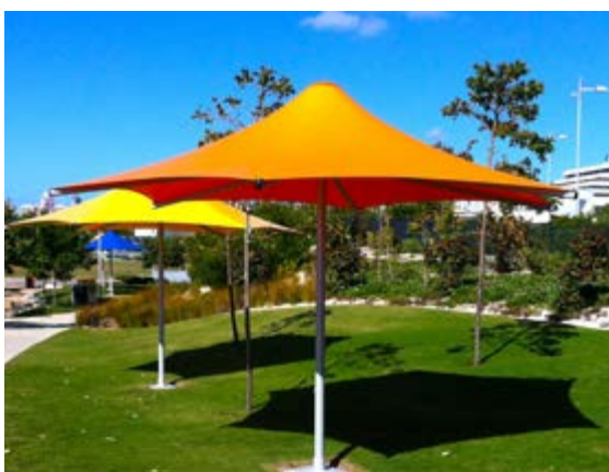
SUNSET 4M HEXAGONAL UMBRELLAS