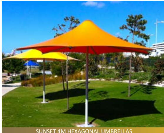
SUNSET 4M HEXAGONAL UMBRELLAS