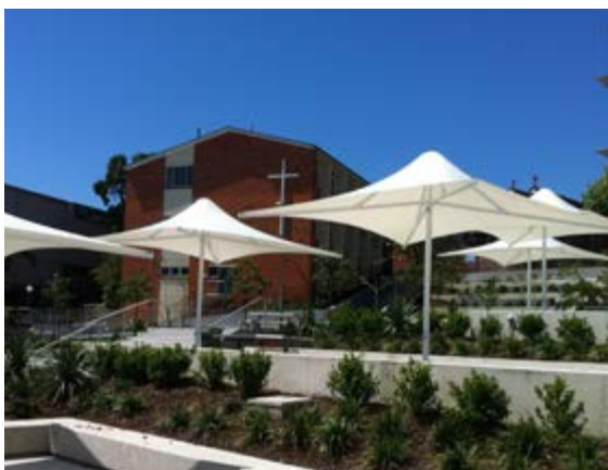
TYPHOON 4M SQUARE UMBRELLAS