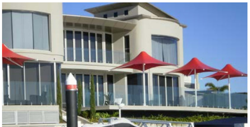
TYPHOON 3M SQUARE UMBRELLAS