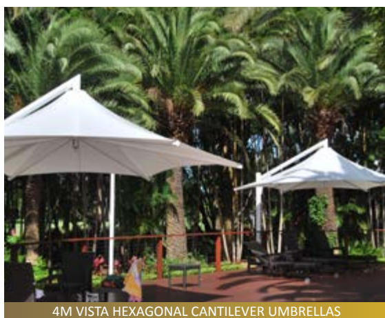
4M VISTA HEXAGONAL CANTILEVER UMBRELLAS