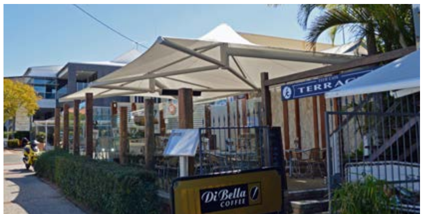
VISTA 4M SQUARE UMBRELLAS WITH INTERNAL FRAME OPTION