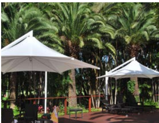
4M VISTA HEXAGONAL CANTILEVER UMBRELLAS